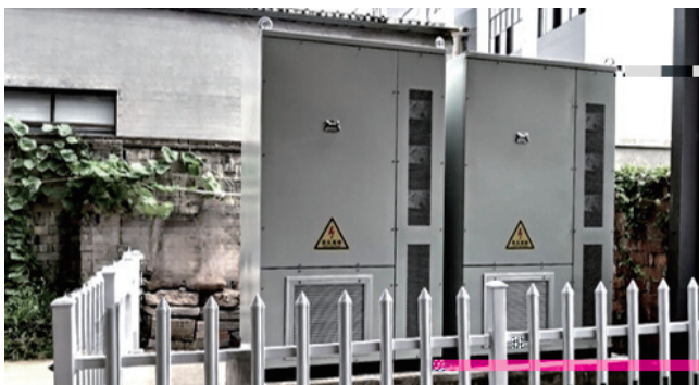
Figure 1: Project Photos

This highly robust, smart, and doubled safety product SunGiga is designed for a set-it-and-forget-it installation and operation.